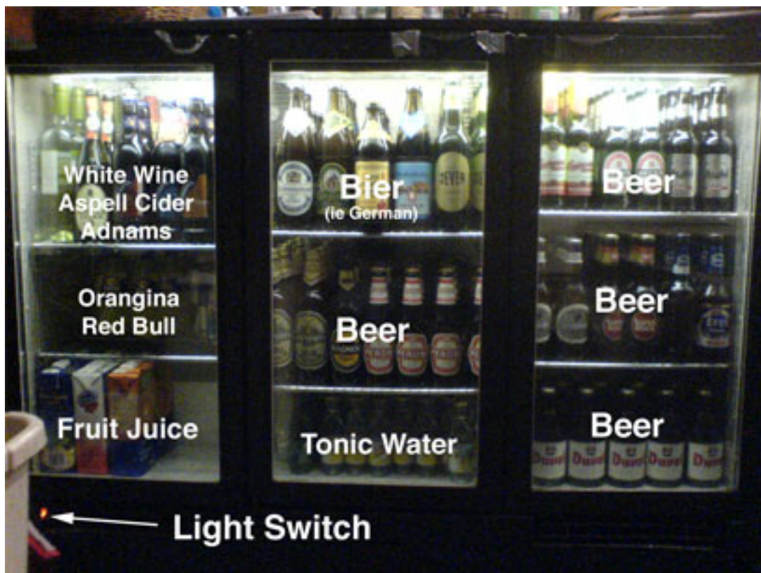
The Beer Fridge

Here are some pictures of the bar, just to get you familiarised with where everything is: