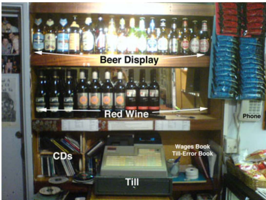
The Till Area