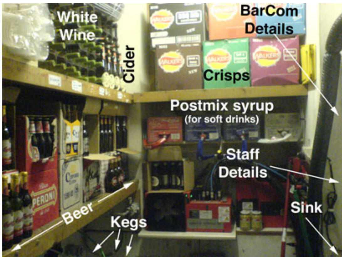
The Middle/Cold Room

Not shown: Whisky section (with glasses below), other spirits (all the upside-down bottles)