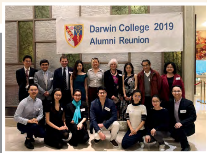
Above: In April the Master and Development Director enjoyed the company of alumni at dinner in Beijing.