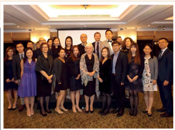
Above: The Master and Development Director pictured with alumni in Hong Kong at a reunion event in April.