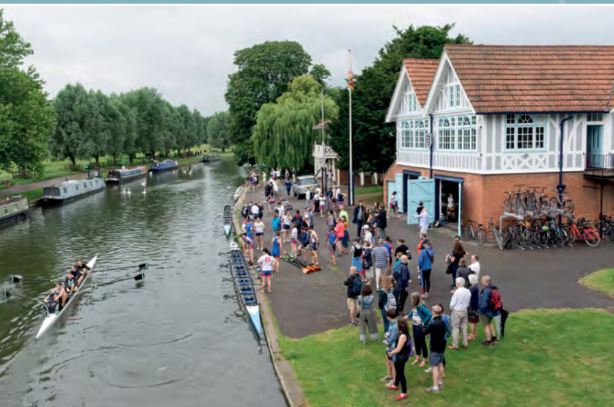
Above: Waiting to row