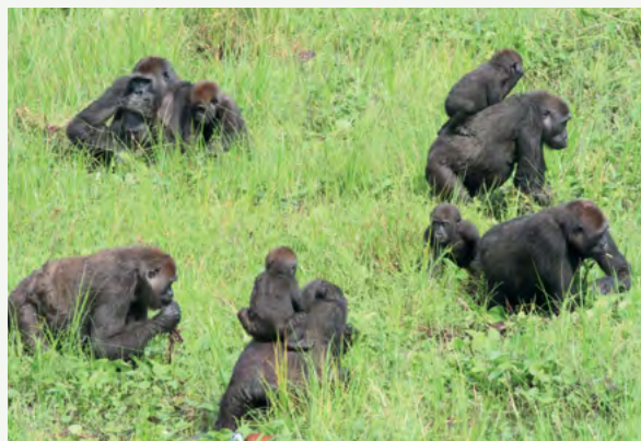
Above: Three western gorilla groups (Conan, Morpheus and Zulu) mingle peacefully as they feed at the Mbeli Bai forest clearing in the Nouabale-Ndoki National Park, Republic of Congo.

“Our findings provide yet more evidence that these endangered animals are deeply intelligent and sophisticated, and that we humans are perhaps not quite as special as we might like to think.”